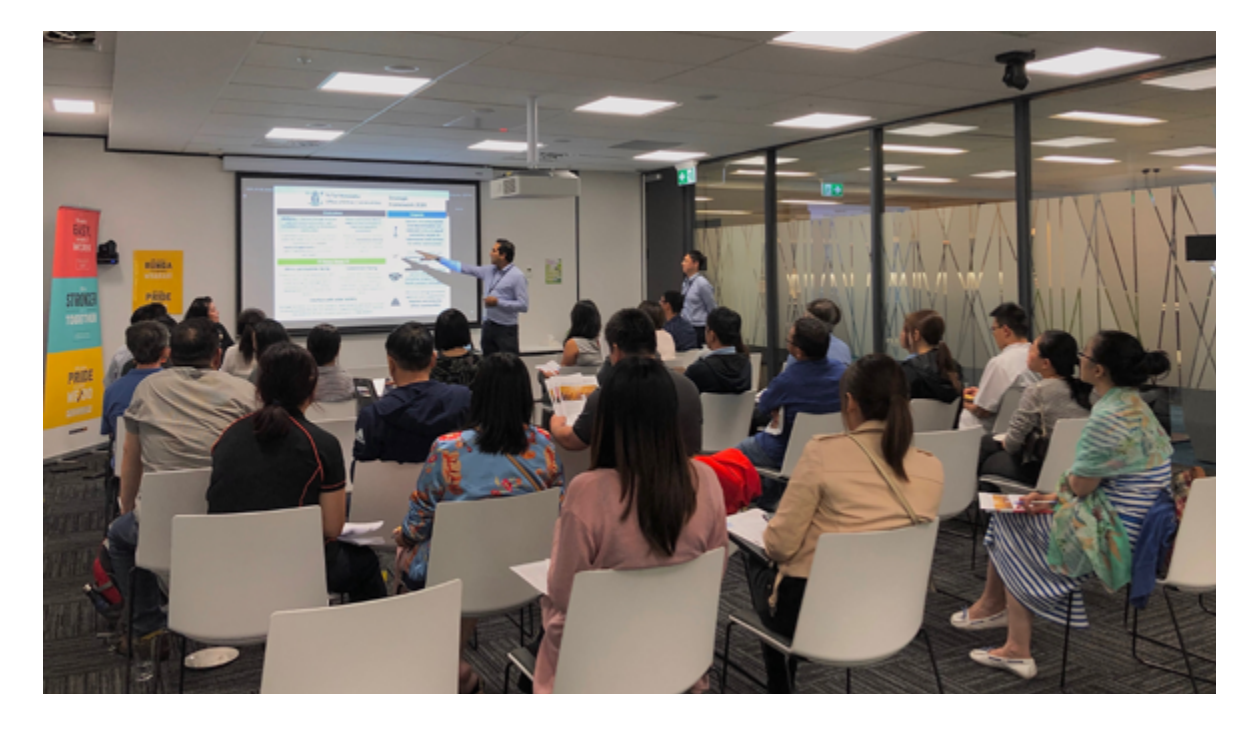
Northern Community Engagement team ECDF Workshop with Chinese Community, March 2020.

Two case studies that show the variety of the initiatives we support are provided below.