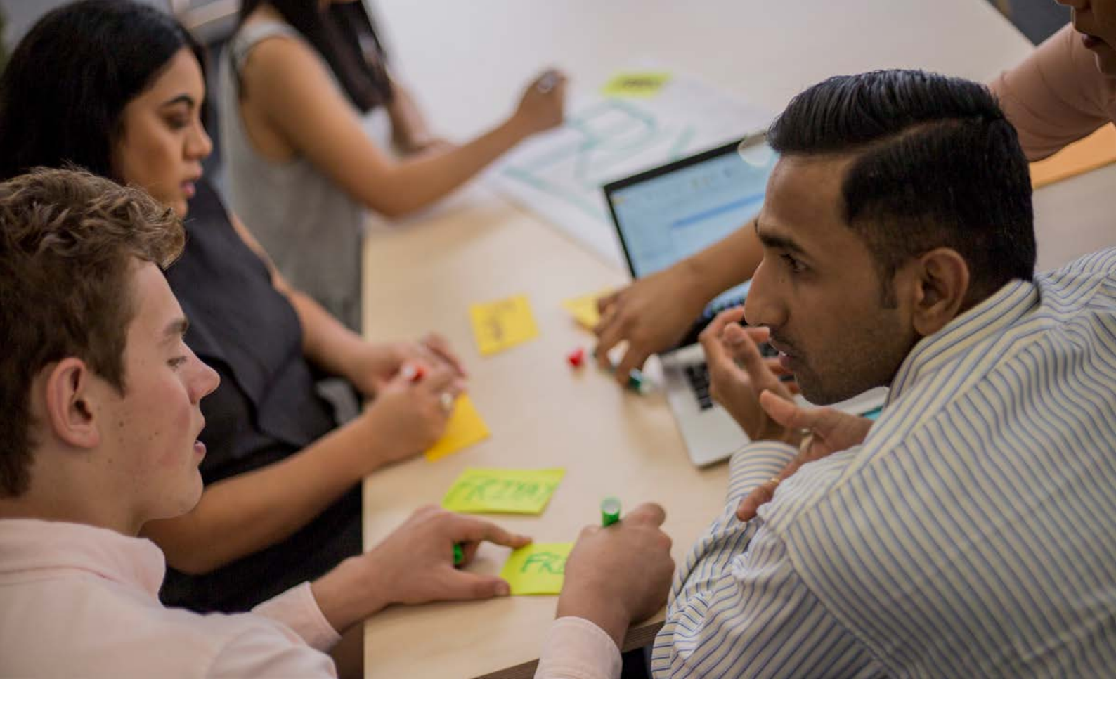
Cohort - Temporary Migrant Exploitation